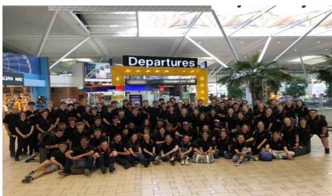
NZ Tour 2019